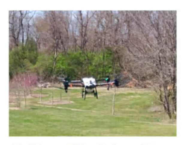
Aerial drone pesticide applications are being considered by some applicators.

T here has been a high level of interest in using unmanned drones to apply pesticides to crops in certain situations. There has also been some confusion in terms of what pesticide certifications are