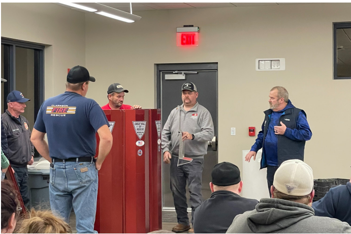
First responders learned how to use the Great Wall grain entrapment equipment.